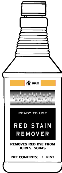
Available in 6x1 pint containers (10642)