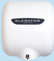
Model XL-BW Surface-mounted, Automatic, White Polymer (BMC) Cover