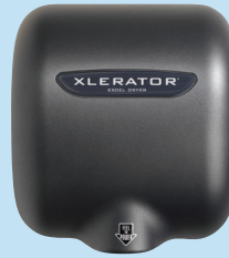
Model XL-GR Surface-mounted, Automatic, Graphite Textured Painted Cover