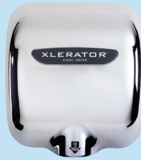
Model XL-C Surface-mounted, Automatic, Chrome Plated Cover