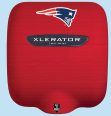
Model XL-SI* Surface-mounted, Automatic, Custom Special Image Cover

*Note: Exclusive digital image technology allows for the addition of Company, School or Team logos with any color, design or a 'green message'