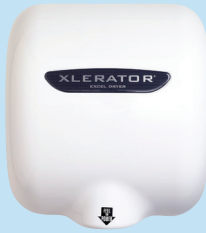
Model XL-W Surface-mounted, Automatic, White Epoxy Painted Cover