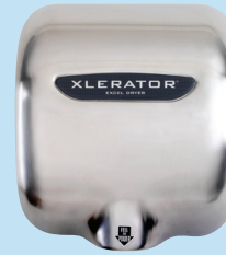
Model XL-SB Surface-mounted, Automatic, Brushed Stainless Steel Cover