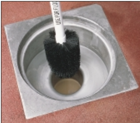
14041 with 14042 Handle