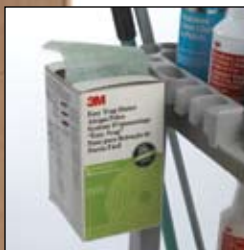
Easy mounting mini-dispenser