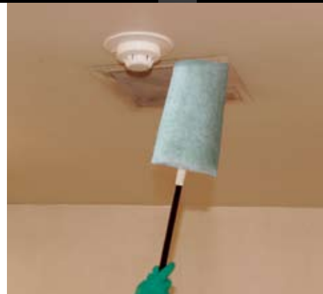
Works with most high dusting tools to trap and hold more dust.