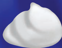
Foam soap from one push