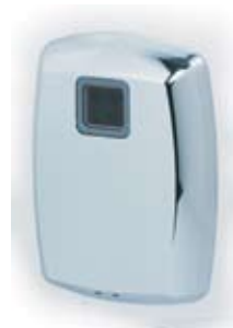
Merlin™ AutoFlush for Tank