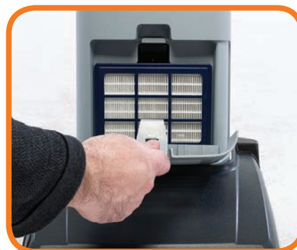
Standard certified HEPA filter